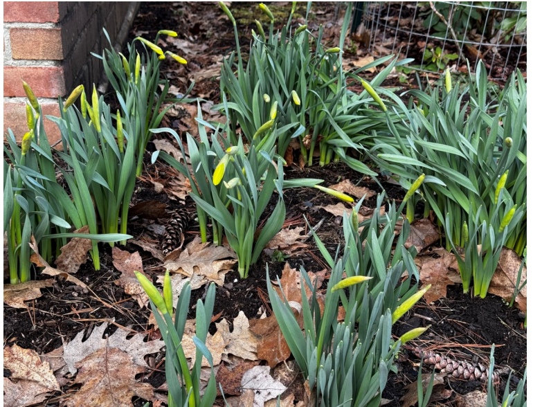
Spring is springing! Check out the daffodils by the main entrance.