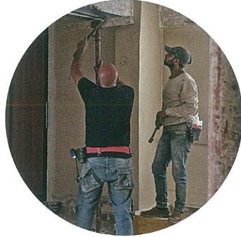
HOUSE RESTORATION - VILLAT

WE ARE THERE , with the Middle East Council of Churches, repairing damage to alleviate the suffering of the Syrian people following a devastating 7.8 magnitude earthquake.